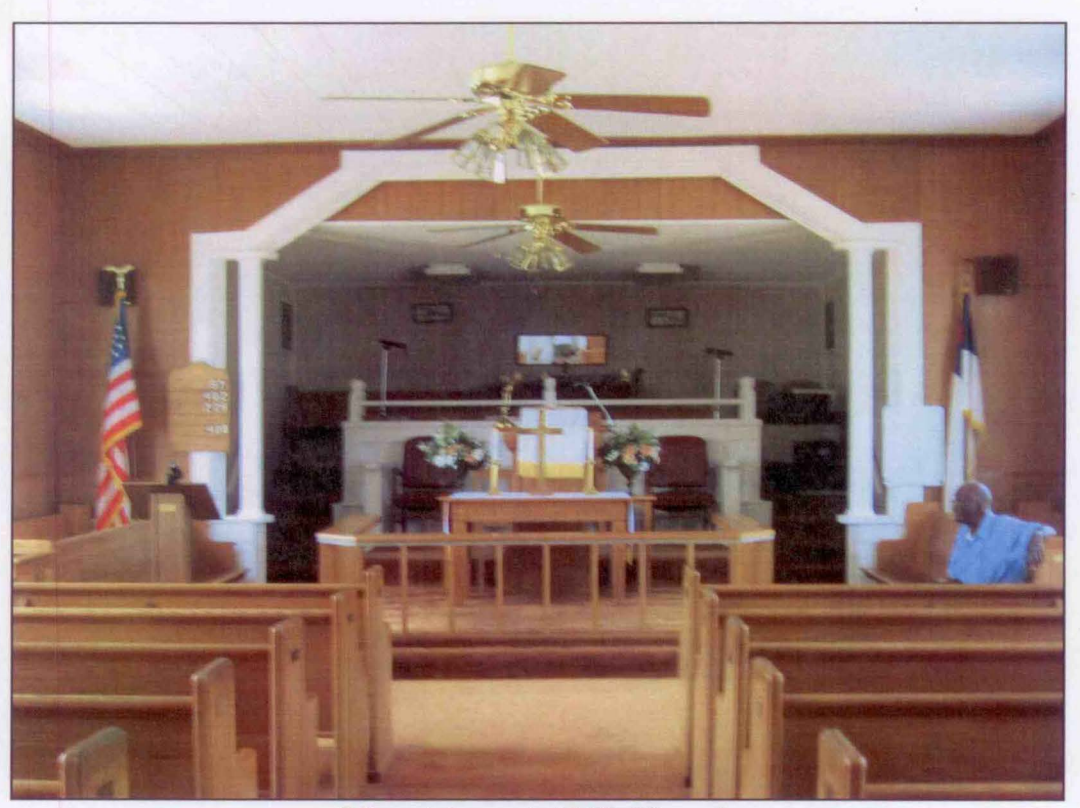
Mount Ararat AME Church Interior, Looking West