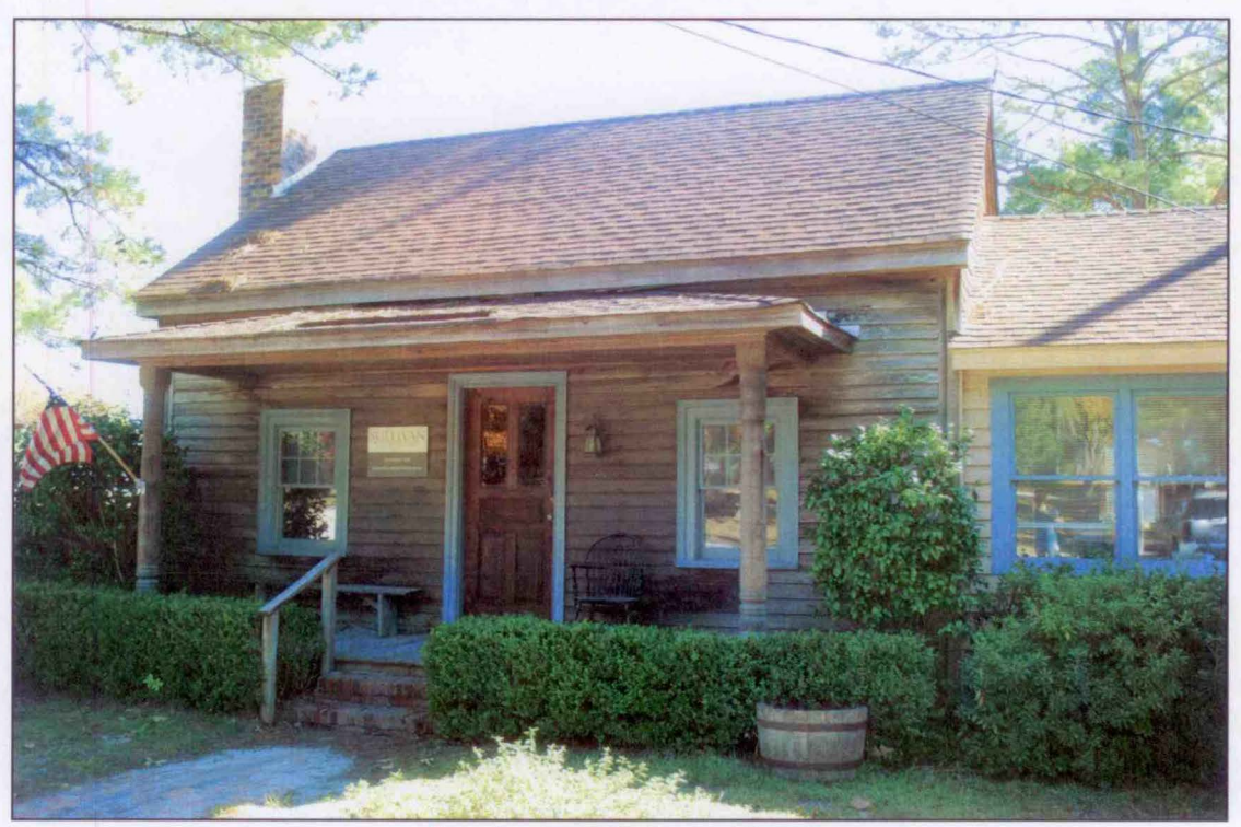
101 Scotts Hill Loop Road Structure in question that was recommended to be removed from the National Register boundary