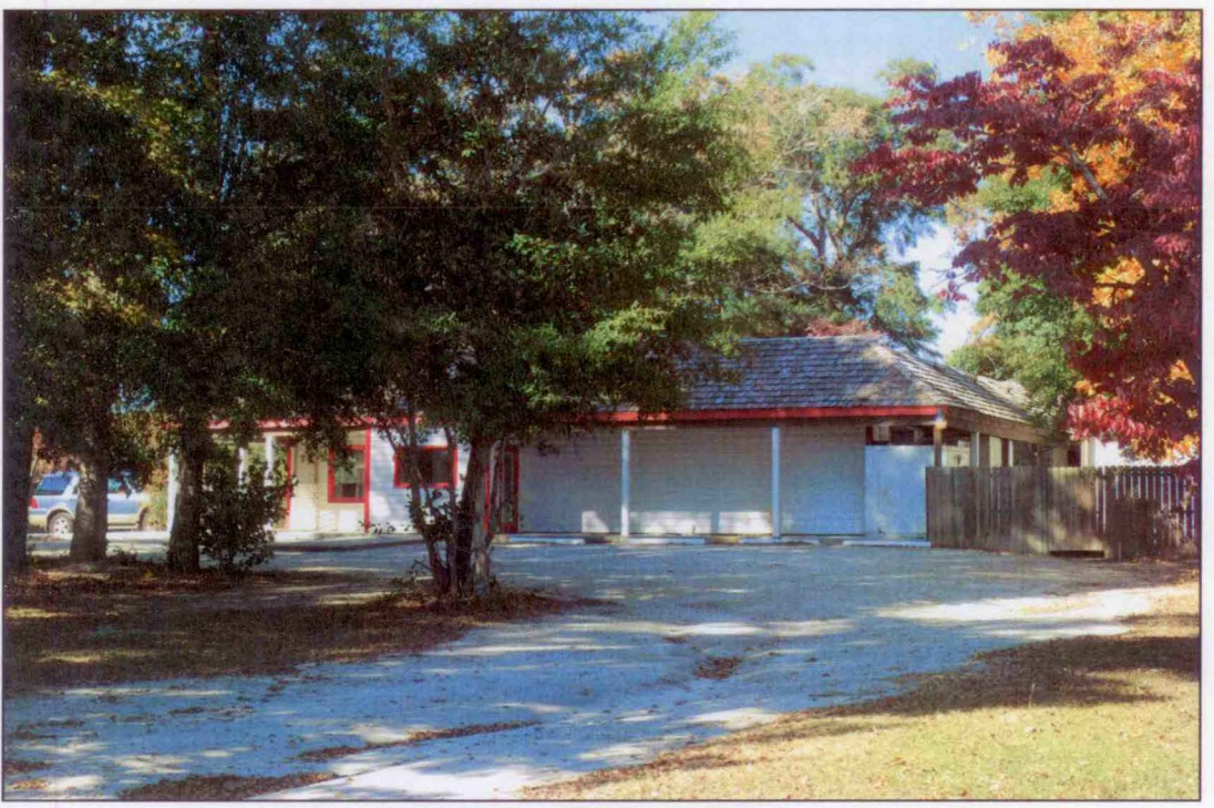
55 Scotts Hill Loop Road Mako's Raw Bar and Grill, directly northwest of building in question